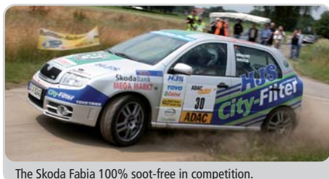
The Skoda Fabia 100% soot-free in competition.

In its exhaust regulations 2004, the German Motorsport-bund (DMSB) regulates for diesel powered vehicles the usage of a particulate filter. HJS developed a high-performance particulate filter for diesel powered vehicles in the context of the Alfa 147 Cup. This particulate filter meets all essential Motorsport requirements. For up to date Race-Trucks of the FIA European Truck Racing Championship, HJS also offers diesel particulate filters.