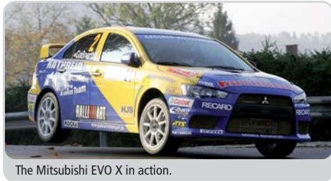
The Mitsubishi EVO X in action.

HJS has developed an exhaust system for Mitsubishi EVO VII up to X and Subaru N15 including FIA homologated WRC catalytic converters. The exhaust system is made of stainless steel. We also offer an optimized front pipe for the Mitsubishi VII / VIII / IX / X.