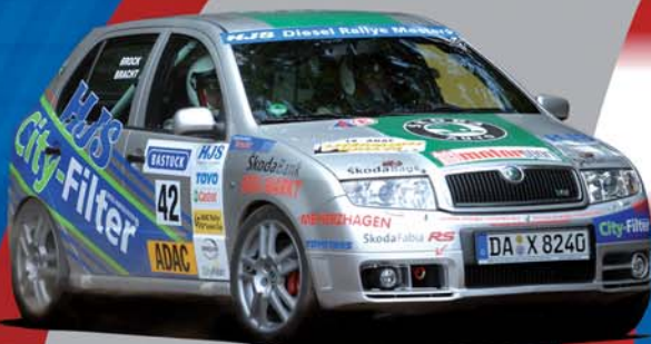
Diesel Particulate Filters